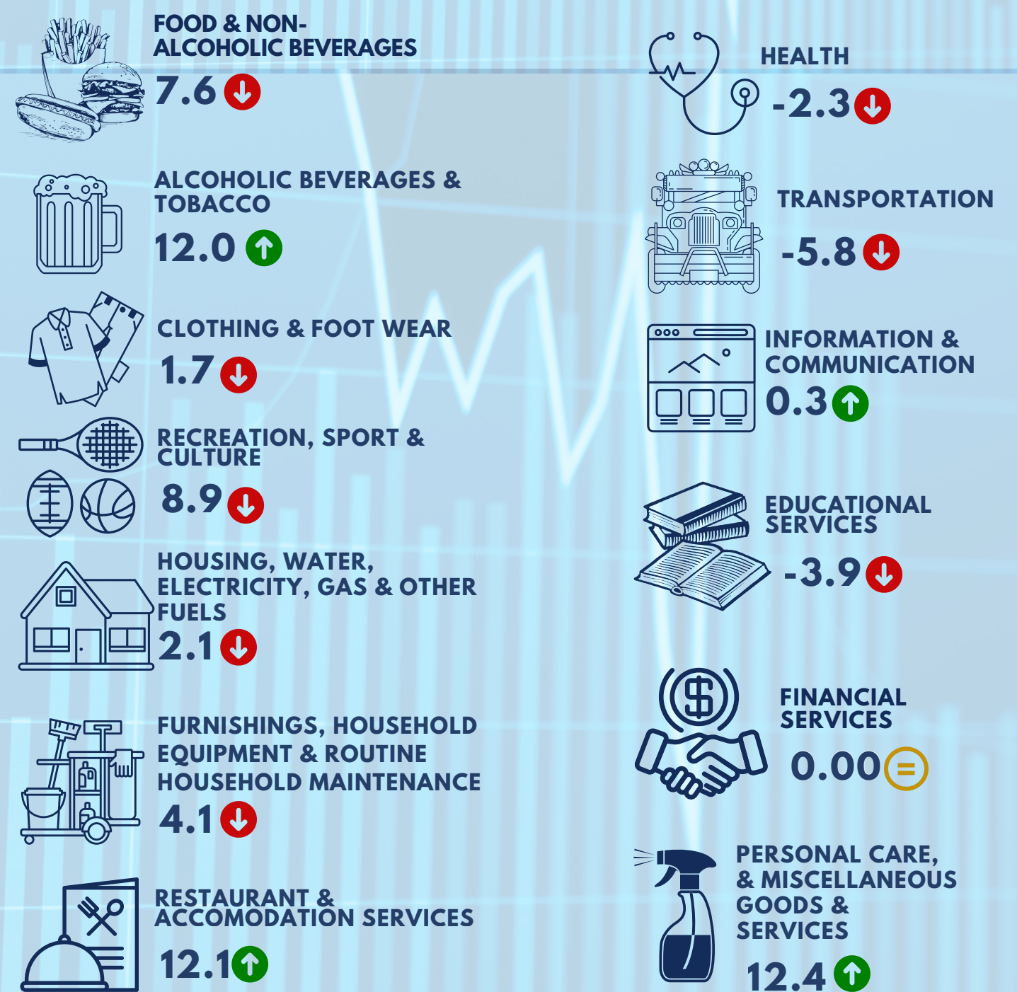
ANNUAL BOTTOM 30% INCOME INFLATION RATES OF MAJOR COMMODITY GROUPS IN GUIMARAS