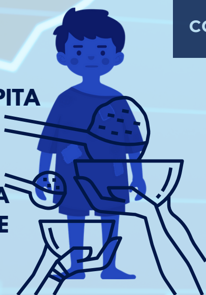
TOP 3 FOOD COMMODITIES WITH HIGHEST PERCENT CONTRIBUTION TO 2023 FOOD INFLATION FOR THE BOTTOM 30% INCOME HOUSEHOLDS

BASED ON THE POVERTY CONCEPT, HOUSEHOLDS WHOSE PER CAPITA INCOME FALLS BELOW THE BOTTOM 30 PERCENT OF THE CUMULATIVE PER CAPITA DISTRIBUTION BELONGS TO THE LOW-INCOME GROUP.