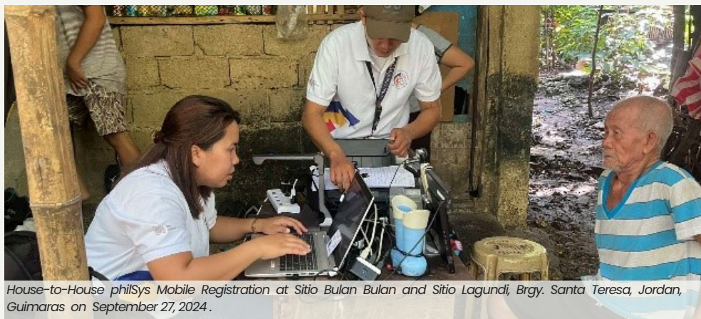
House-to-House PhilSys Mobile Registration at Sitio Bulan Bulan and Sitio Lagundi, Brgy. Santa Teresa, Jordan, Guimaras on September 27, 2024.

As of September 24, 2024, the PSA-Guimaras recorded 2,045 registrations, a testament to the extensive groundwork and community engagement the team has executed since the beginning of the third quarter.