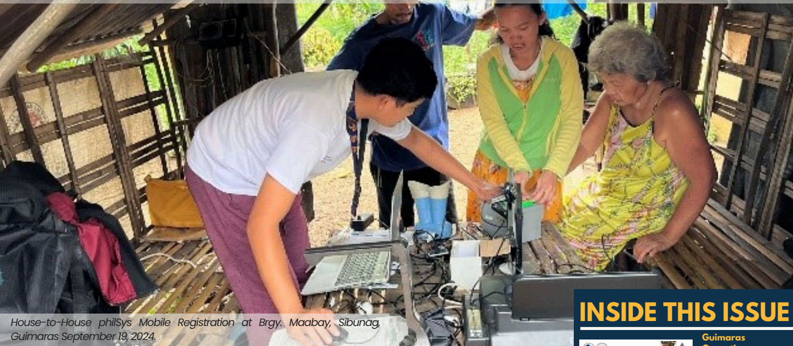
House-to-House philSys Mobile Registration at Brgy. Maabay, Sibunag, Guimaras September 19, 2024.

The Philippine Statistics Authority (PSA)-Guimaras Provincial Statistical Office continues its efforts to bring the Philippine Identification System (PhilSys) services closer to residents through its Barangay and House-to-House registration strategy and successfully registered 43.14% of its target for the third quarter (Q3) with 4,740 registrants across the province.