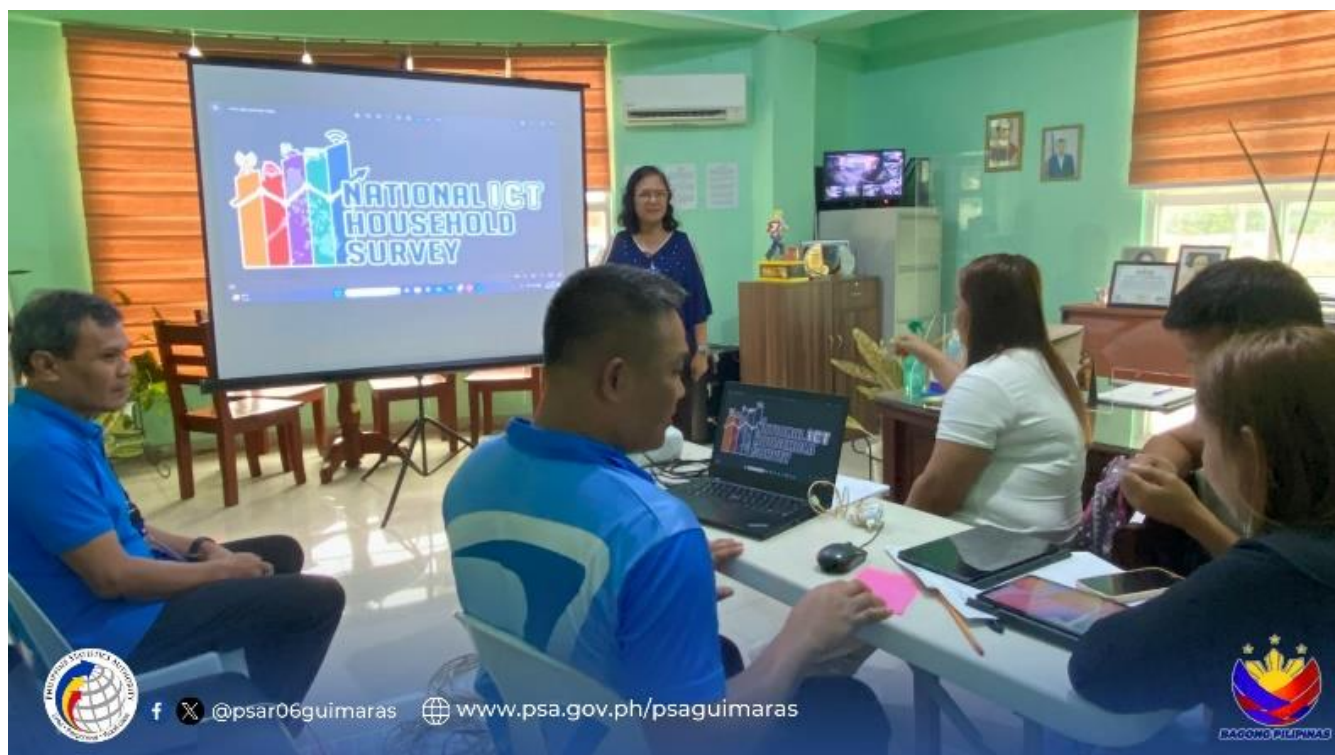
PSA-Guimaras conducts 3 rd level training for the 2023 National Information and Communications Technology Household Survey (NICTHS) on January 29-February 01, 2024.

The information gathered will also serve as valuable input in monitoring existing programs and project development and formulation of future policies geared towards the advancements of ICT in the country.