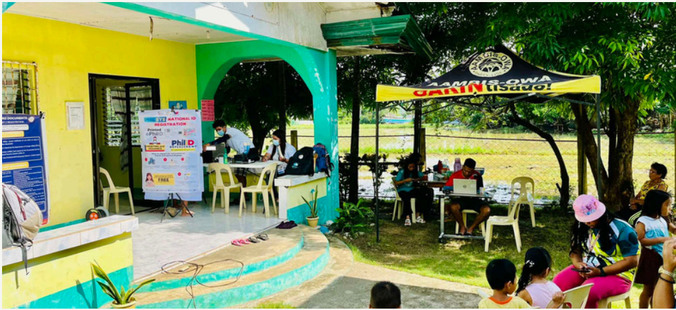
PhilSys Guimaras conducts mobile registration in Brgy., Guiwanon, Nueva Valencia, Guimaras June 27, 2024.

In Guimaras, personnel utilized motorcycle to cross rough roads, and motorboat to cross islands to reach Geographically-Isolated and Disadvantaged Areas (GIDAs) for the conduct PhilSys mobile registration.