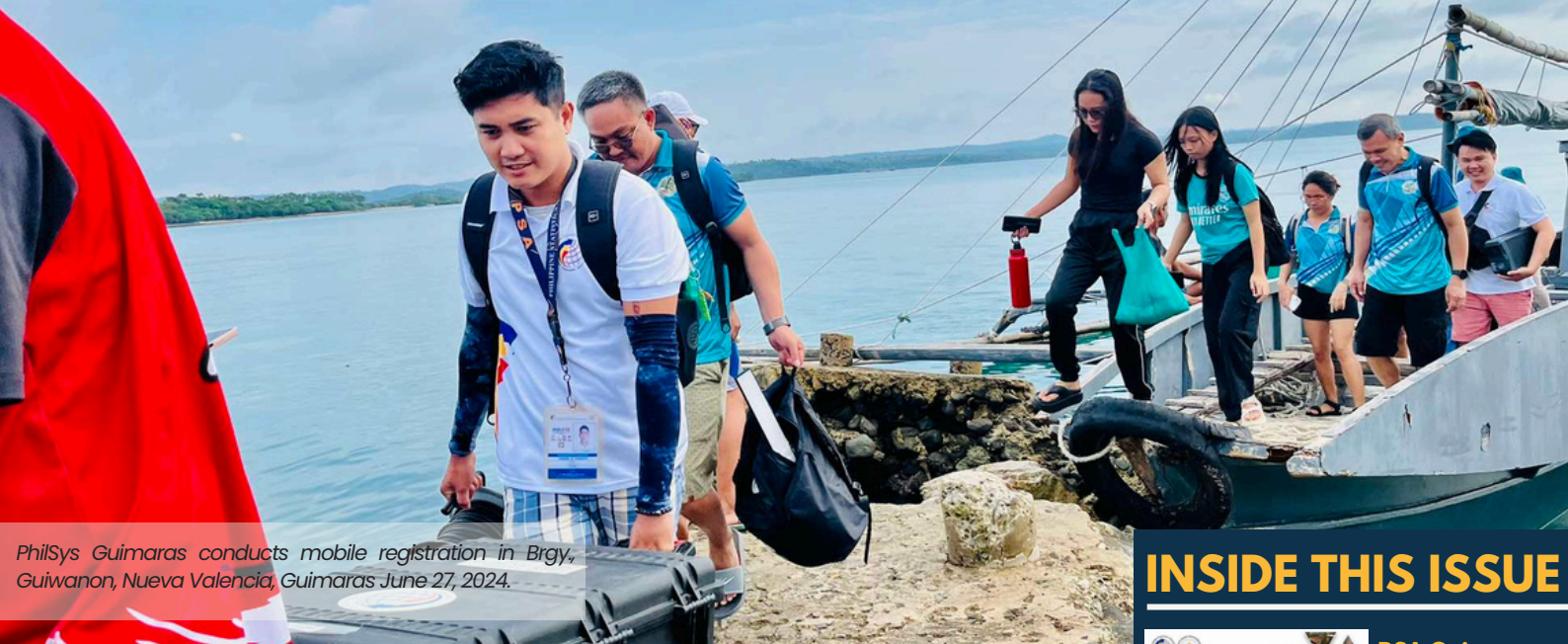
PhilSys Guimaras conducts mobile registration in Brgy. Guiwanon, Nueva Valencia, Guimaras June 27, 2024.

The Philippine Statistics Authority (PSA)-Guimaras Provincial Statistical Office reached 51.51 % of the 10,760 thousand target registrations for the Philippine Identification System (PhilSys) in 2024.