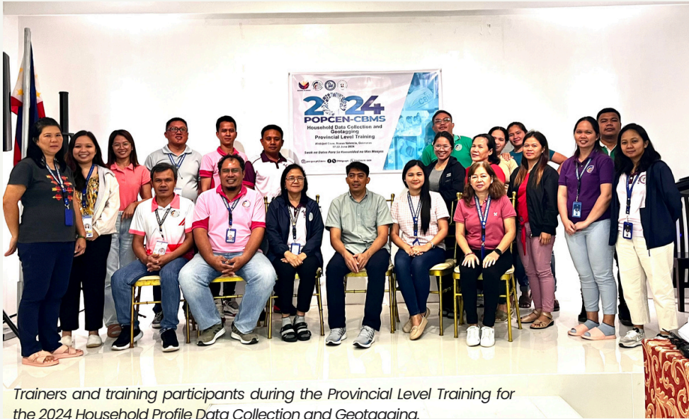
Trainers and training participants during the Provincial Level Training for the 2024 Household Profile Data Collection and Geotagging.

The Philippine Statistics Authority (PSA) - Guimaras Provincial Statistical Office conducted its Provincial and Municipal Level Training on Household Profile Data Collection and Geotagging in preparation for the upcoming nationwide rollout of the 2024 Census of Population and Community-Based Monitoring System (POPCEN-CBMS).