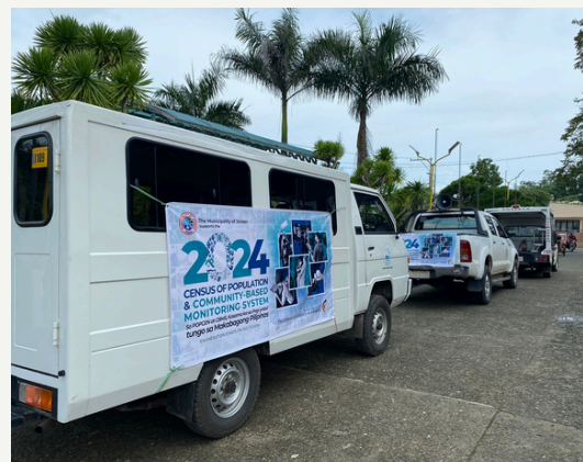
Members of the Municipal Census-CBMS Coordinating Board and POPCEN-CBMS field personnel conducts Bandilyo campaign in the Municipality of Jordan.

The mapped route was followed accessing all the barangays in every municipality where the official POPCEN-CBMS public announcement was played, and brochures and primers were distributed to the public and barangays to elicit support.