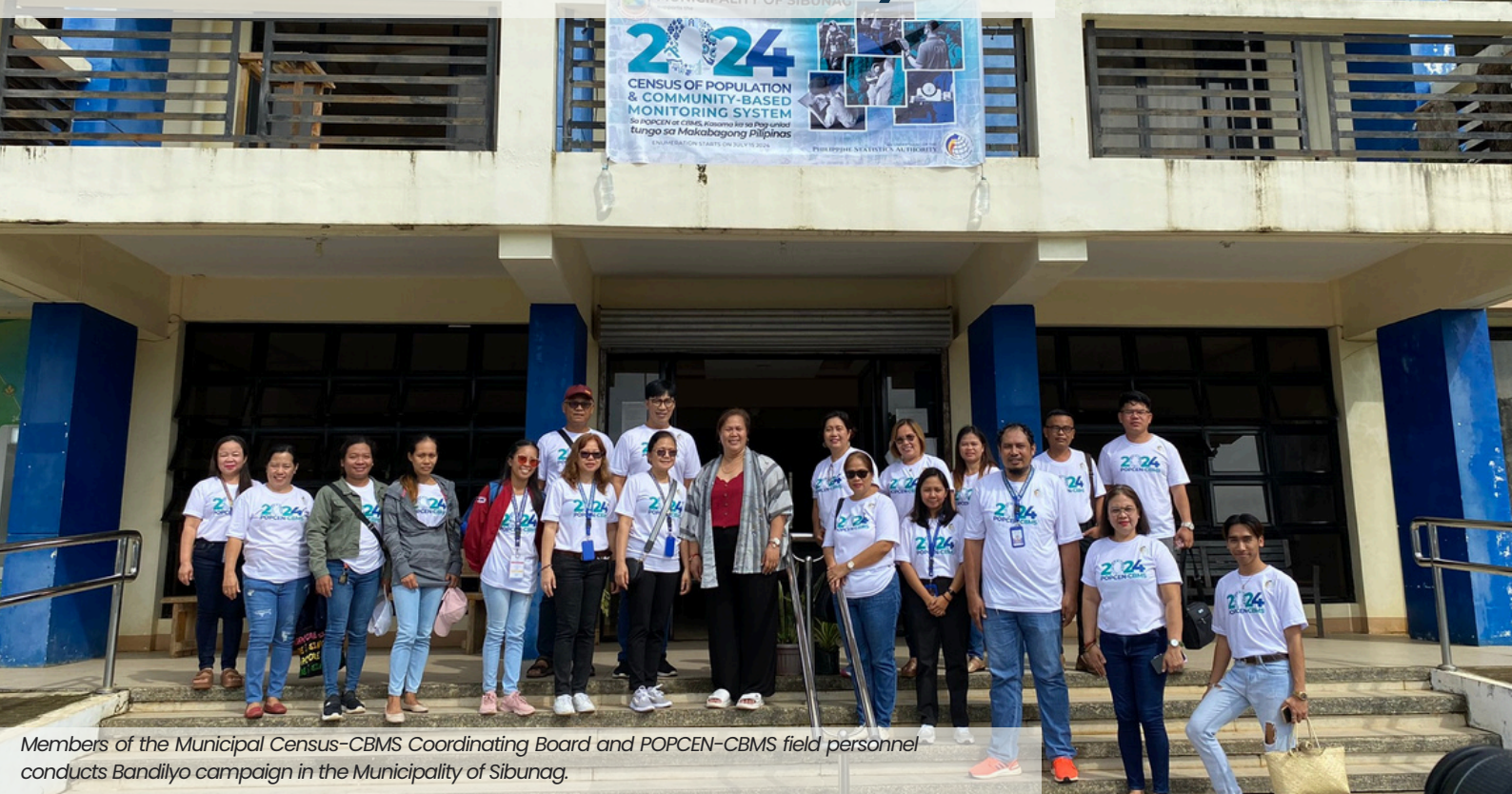
Members of the Municipal Census-CBMS Coordinating Board and POPCEN-CBMS field personnel conducts Bandilyo campaign in the Municipality of Sibunag.

The Philippine Statistics Authority (PSA) - Guimaras Provincial Statistical Office and all five municipalities of the province joined forces for the conduct of the 2024 Census of Population and Community-Based Monitoring System (POPCEN-CBMS) Bandilyo on 10-12 and 15 of July 2024.