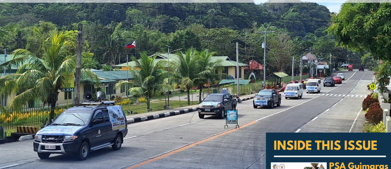
Information Caravan during the opening of the 34th Civil Registration Month Celebration in Guimaras visiting the five municipalities.

The month-long celebration of the 34th Civil Registration Month (CRM) in Guimaras province officially opened on February 2, 2024, with an information drive/caravan around the province from the town of Buenavista to San Lorenzo, Sibunag, Nueva Valencia, and ended up in Jordan for the Opening Program.