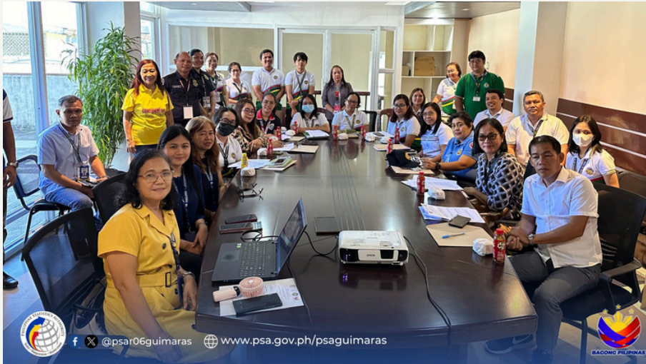
Convening of the Guimaras Provincial Community-Based Monitoring System (CBMS) Coordinating Board (PCCB) in preparation for the upcoming 2024 CBMS Implementation.

The Philippine Statistics Authority (PSA)-Guimaras Provincial Statistical Office, in partnership with the Provincial and Municipal Local Government Units (P/MLGUs) of Guimaras, successfully convened all its Community-Based Monitoring System (CBMS) Convening Boards (CCBs), gearing up for the upcoming 2024 CBMS implementation.