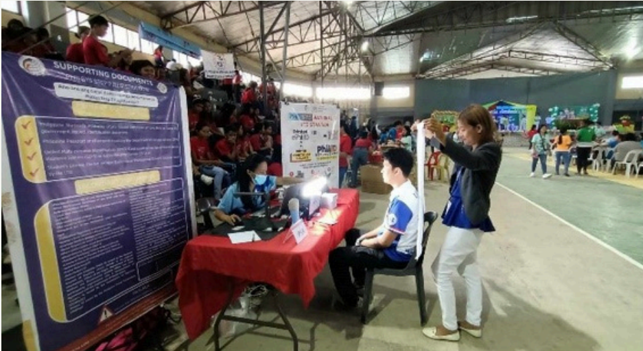
PhilSys Co-location during Provincial Childrens' Day Celebration at Provincial Gym, Jordan, Guimaras on November 29, 2023.

A total of 5,996 Guimarasnons in the Philippine Identification (National ID) in 2023, facilitated by the Philippine Identification System (PhilSys) of the Philippine Statistics Authority (PSA)-Guimaras Provincial Statistical Office