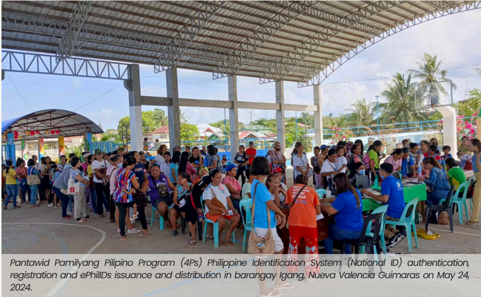
Pantawid Pamilyang Pilipino Program (4Ps) Philippine Identification System (National ID) authentication, registration and ePhillIDs issuance and distribution in barangay Igang, Nueva Valencia Guimaras on May 24, 2024.

The Philippine Statistics Authority (PSA) Guimaras Provincial Statistical Office successfully implemented the Philippine Identification System (National ID) authentication for the Pantawid Pamilyang Pilipino Program (4Ps), reaching a total of 4,572 beneficiaries in April 2024.