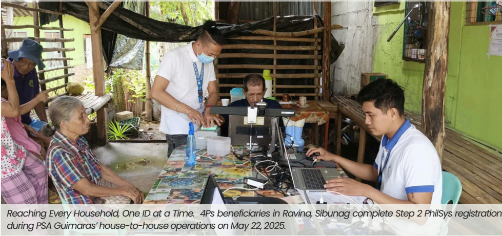
Reaching Every Household, One ID at a Time. 4Ps beneficiaries in Ravina, Sibunag complete Step 2 PhilSys registration during PSA Guimaras' house-to-house operations on May 22, 2025.

easier to open bank accounts, claim social benefits, access government programs, and verify their identity in both public and private transactions.