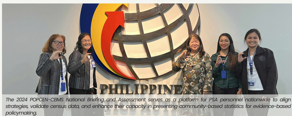
The 2024 POPCEN-CBMS National Briefing and Assessment serves as a platform for PSA personnel nationwide to align strategies, validate census data, and enhance their capacity in presenting community-based statistics for evidence-based policymaking.

The 2024 POPCEN-CBMS is a landmark statistical activity that provides an updated socio-economic and demographic profile of communities across the country, essential for targeted policymaking and sustainable development. /PSA Guimaras