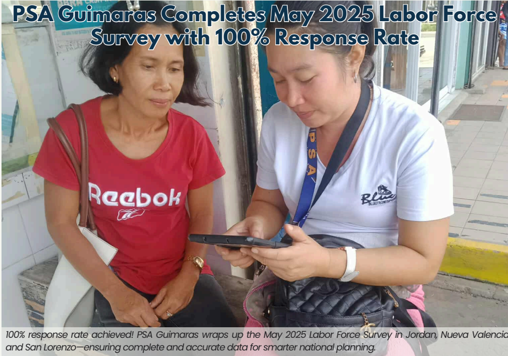
100% response rate achieved! PSA Guimaras wraps up the May 2025 Labor Force Survey in Jordan, Nueva Valencia, and San Lorenzo—ensuring complete and accurate data for smarter national planning.

The Philippine Statistics Authority (PSA) Guimaras completed the May 2025 round of the Labor Force Survey (LFS), achieving a 100% response rate from all 53 sample households across three enumeration areas (EAs) in the province.