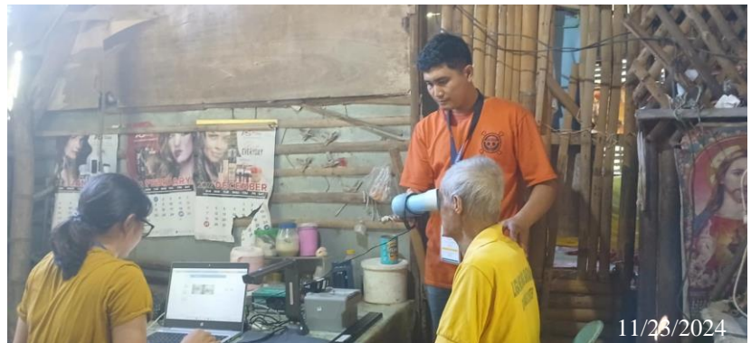
Bringing PhilSys to your doorstep! House-to-House registration in Cabungahan, San Lorenzo, Guimaras on November 23, 2024.

"It's critical that all Filipinos, regardless of age or location, have access to this National ID system. The inclusion of 168 OFWs and the registration of children aged 0-4 underlines our commitment to ensuring that no one is left behind," Losare added.