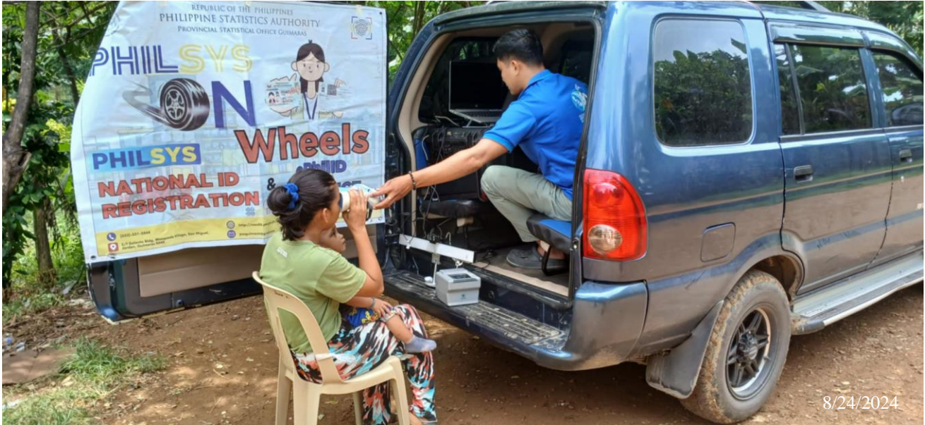
PhilSys on Wheels: Making National IDs accessible to the people of Sitio Ipil, Igcawavan, San Lorenzo, Guimaras.

Date of Release: 08 January 2025 Reference No. 25PSA-0679-PR06