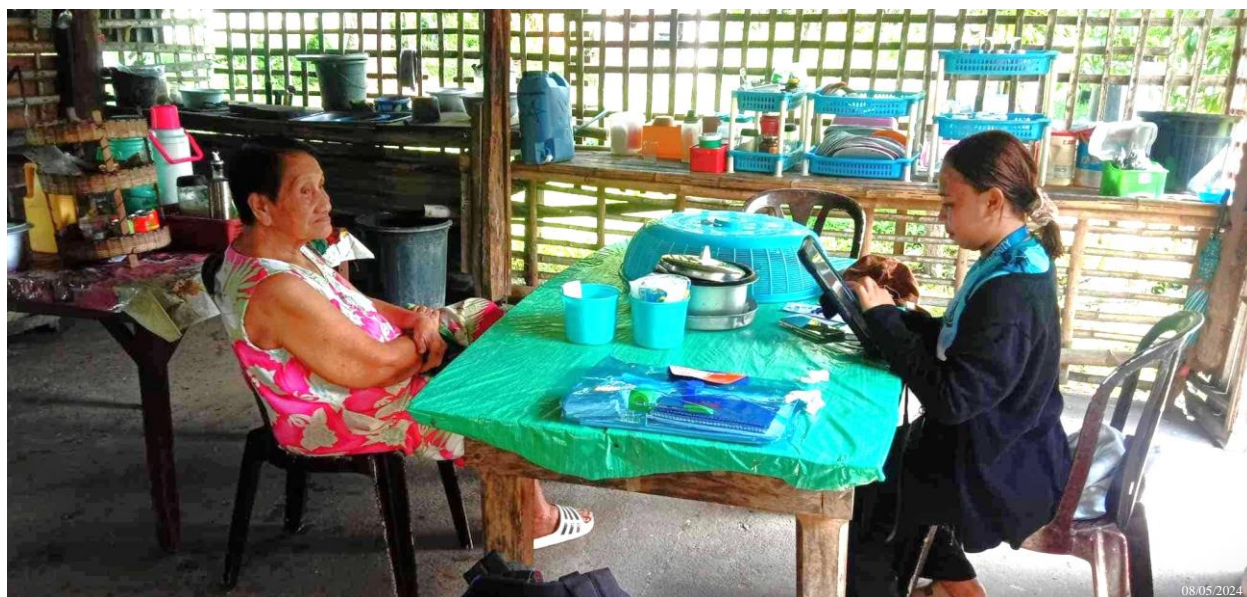
PSA Guimaras personnel conducting Community-Based Monitoring System (CBMS) data collection using the Household Profile Questionnaire (HPQ) during the 2025 CBMS rollout in Guimaras.

Date of Release: 27 May 2025 Reference No.: 25PSA-0679-PR34