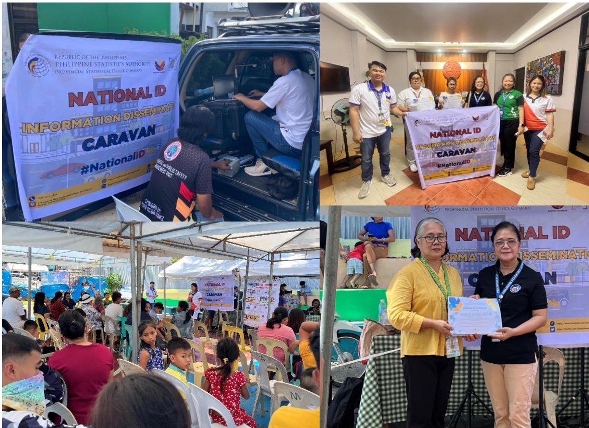
Highlights from PSA-Guimaras’ first-ever National ID Information Dissemination Caravan held in Q1 2025, which included a motorcade, PhilSys on Wheels mobile registration, and public forums. The initiative also supported the province’s successful efforts in exceeding its quarterly registration target by 45%.

The initiative kicked off with a motorcade and PhilSys on Wheels registration at Jordan Wharf, followed by courtesy visits to key agencies and institutions including the Guimaras Island Transport Multipurpose Cooperative (GITMC), Municipal Hall/Offices of Jordan, Guimaras State University (GSU), and provincial offices of DTI, DOLE, and DepEd and proceeded to LGU Nueva Valencia for the mobile registration.