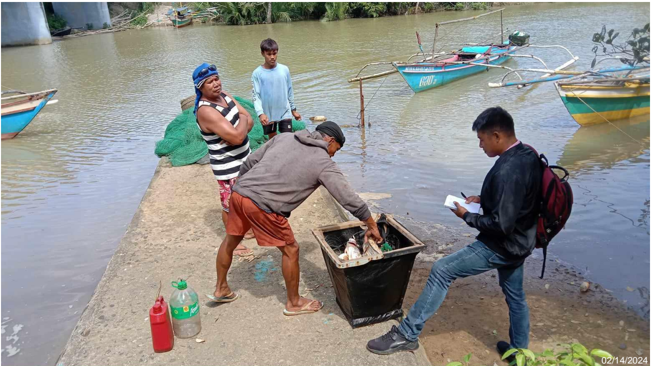
Statistical Researcher (SR) enumerates sample HHs in Guiwanon, Nueva Valencia, Guimaras.

Date of Release: 20 March 2025 Reference No. 25PSA-0679-PR22