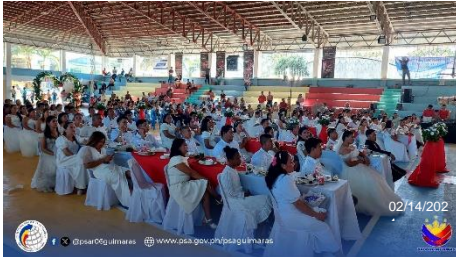
A total of 38 couples exchange vows in the Municipality of Buenavista on February 14, 2024