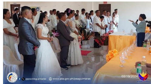
The Municipality of San Lorenzo holds a free civil mass wedding for 29 couples on February 19, 2024.