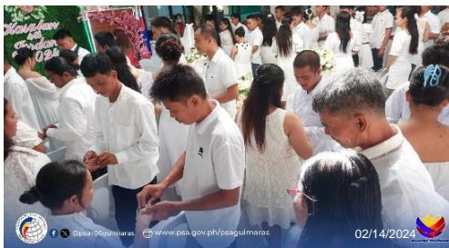
Twenty-eight (28) couples said I Do in the Municipality of Jordan on February 14, 2024