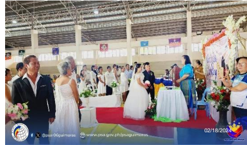
Fifteen (15) couples take the chance to get married during the free civil mass wedding in the Municipality of Sibunag on February 18, 2024.