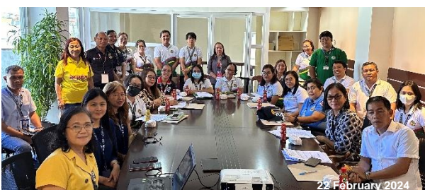
Convening of the Provincial Community-Based Monitoring System (CBMS) Coordinating Board (PCCB) in Guimaras for the upcoming 2024 CBMS Implementation.

February 23, 2024 – GUIMARAS. The Philippine Statistics Authority (PSA) - Guimaras Provincial Statistical Office, in partnership with the Provincial and Municipal Local Government Units (P/MLGUs) of Guimaras, successfully convened all its Community-Based Monitoring System (CBMS) Convening Boards (CCBs), gearing up for the upcoming 2024 CBMS implementation.