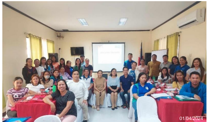
PSA-Guimaras conducts training for the 2024 L January round labor Force Survey (LFS) and 2023 Family Income and Expenditure Survey (FIES) V2 at NVMPC Concordia Sur, Nueva Valencia, Guimaras

Ravina (16HHs), Sabang (17HHs), San Isidro (41HHs), and Sebaste (26HHs) were the barangays covered in Sibunag.