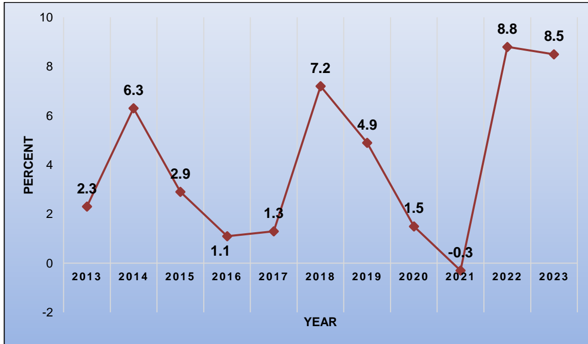
Figure 2. Headline Average Inflation rates in Guimaras, Food Items, 2013-2023

Source: Retail Price Survey of Commodities for the Generation of Consumer Price Index, Philippine Statistics Authority