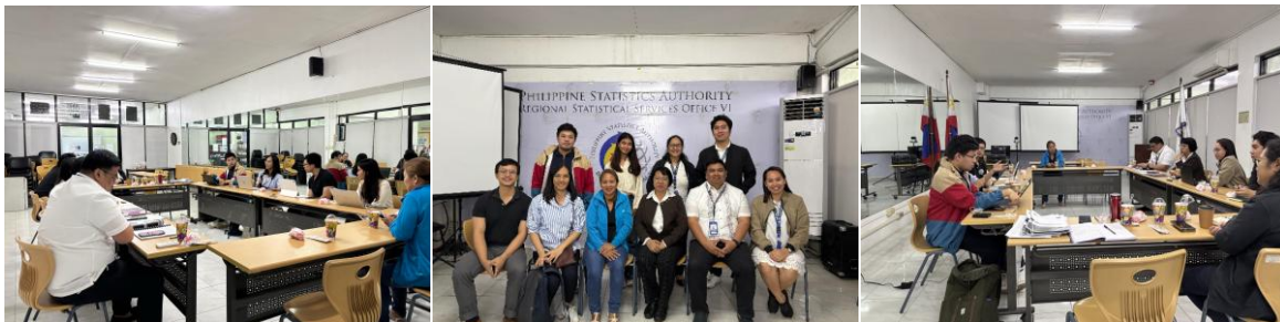
NEDA-ANRES, PSA RSSO VI, and PSA IPSO participants for the focus group discussion on Remote Sensing for Rice Production Monitoring and Forecasting

The FGD served as a platform for NEDA and PSA to exchange insights and recommendations aimed at improving data integration and accuracy in rice production monitoring.