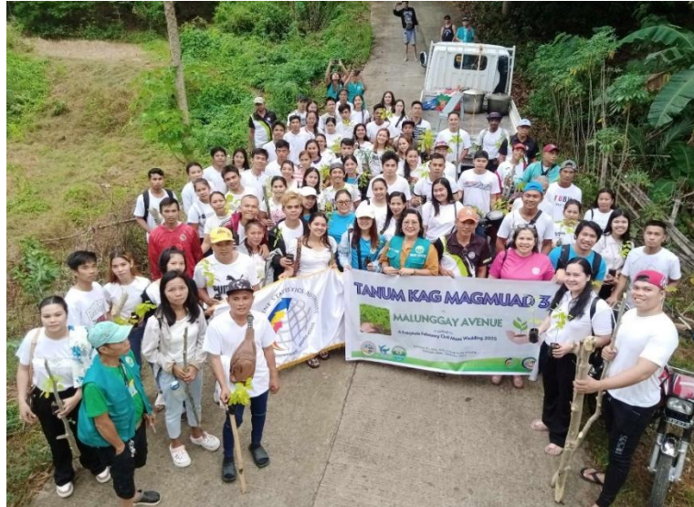
PSA Iloilo with Couples that joined Tree-Planting for Love and Sustainability in Tigbauan, Iloilo

As PSA Iloilo and its partners continue to champion civic and ecological responsibility, these initiatives are planting not just trees, but also the seeds of a greener, more resilient future for generations to come.