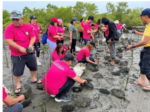
Participants from PSA Iloilo and ACRI actively take part in a Mangrove Planting at Leganes Integrated Katunggan Ecopark.