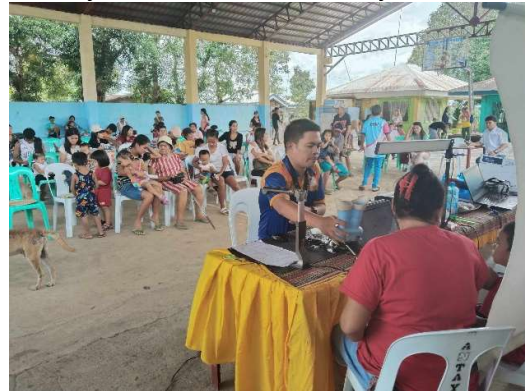
Brgy. Bantayan, San Enrique during the Rehistro Bulilit Kickoff

PSA IPSO's has adapted the initiative of Rehistro Bulilit campaign which encourages parents with children below 5 years old to register to the National ID. It has been a challenge to the registration team the temper of the children below 5 years old during registration. Thus, with this campaign, the team initiates parlor games, give away candies to children in order for a smooth registration flow of the registration process. This has been also an opportunity to the PSO to conduct an Information