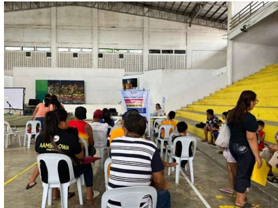
National ID System team in partnership with Guimbal LCRO for Certificate of Live Birth Registration

Mobile registration activities are still ongoing in several other municipalities, with registration teams visiting barangays to ensure wider coverage and service accessibility for those in need of delayed birth registration.