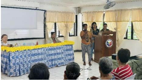
Members of the IPs giving their emotional message of gratitude to PSA and LGU

has allowed them to avail free birth certificates for the elderly to use in availing their social pension, and children to use as a vital requirement in school. Their heartfelt words highlighted the transformative effect of the BRAP initiative, as it ensures their rightful identity and inclusion in societal processes.