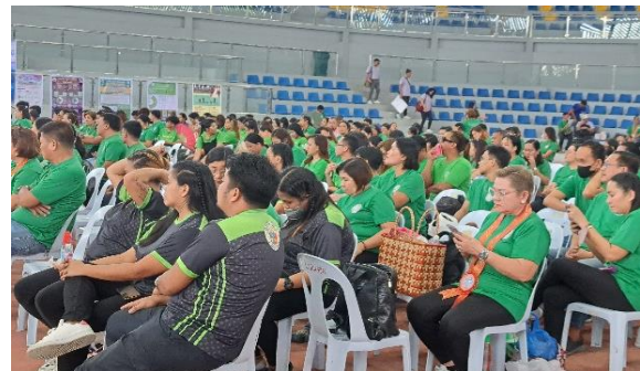
Participants during the 34 th Civil Registration Month Opening Ceremony at the Tamasak Arena Gym, Barotac Nuevo

The Philippine Statistics Authority - Iloilo Provincial Statistics Authority (IPSO), in partnership with the Association of Civil Registrars of Iloilo (ACRI) Inc., led the opening ceremony of the 34 th Civil Registration Month held at the Tamasak Arena Gym, Barotac Nuevo, Iloilo on February 2, 2023. The celebration was in line with this year's theme, "CRVS: The Future of Seamless Services".