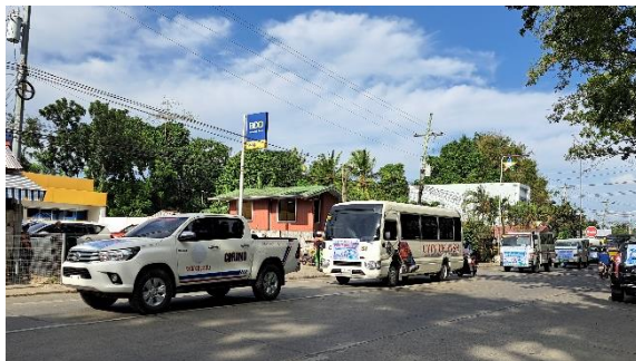
Route 2 vehicles from the City of Passi lined up during the motorcade

The event commenced with simultaneous motorcades from six different locations across the province, converging at the Tamasak Arena Gym for the program proper. The lead vehicle of each group had a PA system that played the CRVS jingle. The first route started in the Municipality of Carles and was joined by the municipalities of Estancia, Balasan, Batad, Sara, Concepcion, San Dionisio, Lemery, Ajuy, Barotac Viejo, San Rafael, Banate, and Anilao. The second group took off in the City of Passi and was joined by the municipalities of San Enrique, Dueñas, Dingle, Pototan, Mina, and New Lucena. The third route started in Calinog and was accompanied by