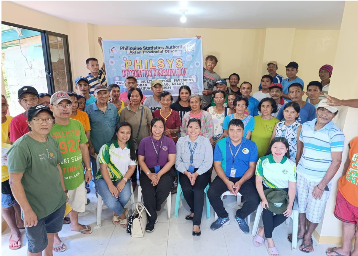
Talangban farmers with the MAO and PhilSys Personnel in a picture.

06 February 2024 – KALIBO, AKLAN: The Philippine Statistics Authority (PSA) Aklan conducted an information dissemination for rice farmers in Barangay Talangban at Talangban Multi-Purpose Pavement, Madalag, on January 23.