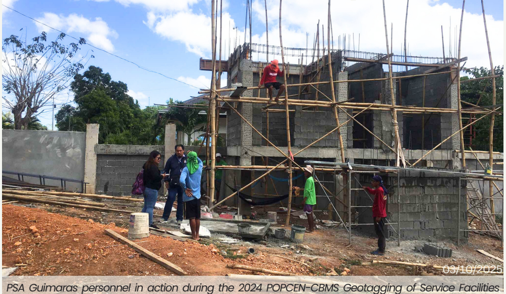
PSA Guimaras personnel in action during the 2024 POPCEN-CBMS Geotagging of Service Facilitie and Government Projects.

The Philippine Statistics Authority (PSA) Guimaras is actively implementing the 2024 POPCEN-CBMS Geotagging of Service Facilities and Government Projects (SFGP), with data collection and map processing operations rolling throughout March 2025.