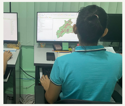
Map Data Processor and Reviewer encoding and scrutinizing shapefiles during the data processing phase.

Losare also pledged that through these geotagging and mapping efforts, PSA Guimaras continues to drive smarter development planning by equipping decision-makers with timely, accurate, and location-based data that will uplift communities and improve the quality of life for every Guimarasnon./PSA Guimaras