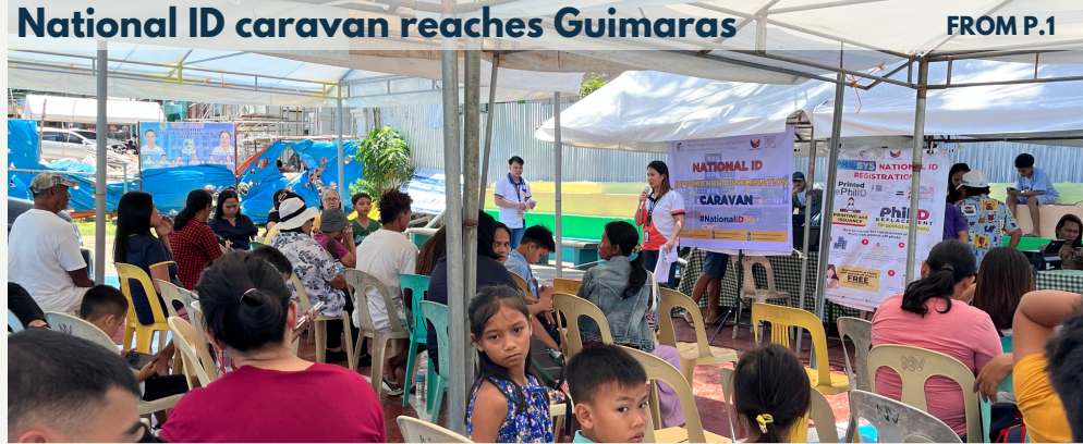
Residents of Guimaras gather at the Nueva Valencia Municipal Plaza to participate in the National ID Information Dissemination Caravan on March 28, 2025. The Philippine Statistics Authority (PSA) provided key updates on the PhilSys program and extended registration and ePhilID services, making the process more accessible for unregistered individuals in the province.

Cooperative (GITMC), the Municipal Hall of Jordan, Guimaras State University (GSU), and the provincial offices of DTI, DOLE, and DepEd.