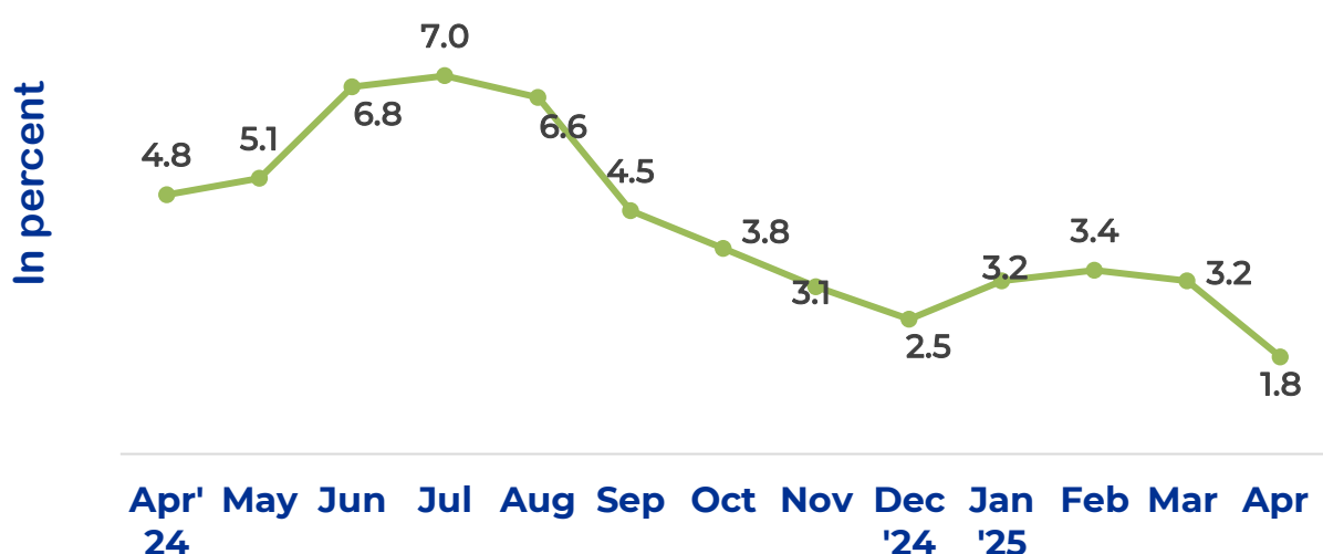
Figure 2. Inflation Rates for the Bottom 30% Income Households in Bacolod City, All Items (2018=100)