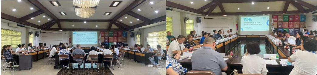
Meeting of the Regional Census-CBMS Coordinating Board on 13 May 2024 at NEDA VI, Iloilo City.

The Philippine Statistics Authority (PSA), together with the National Economic Development Authority (NEDA) VI, and members of the Regional Census-CBMS Coordinating Board (RCCB), convened on 13 May 2024 on the preparation for the 2024 Census of Population and Community-Based Monitoring System (POPCEN-CBMS) roll-out in the region.