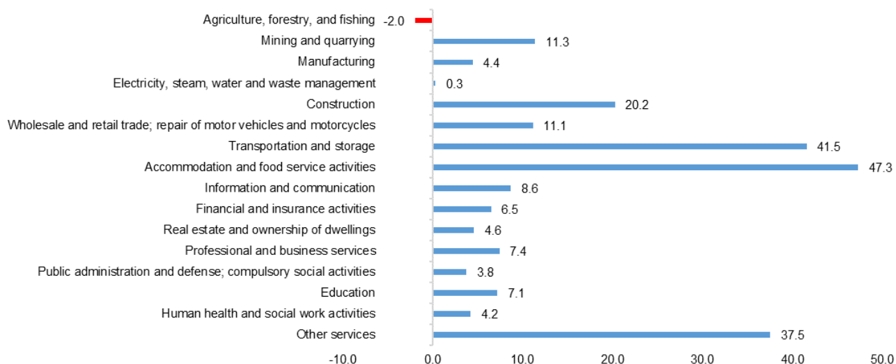
Figure 1. Western Visayas, Growth Rates by Industry: 2021 - 2022 At Constant 2018 Prices, in Percent

The top industries with the fastest growths were the following: Accommodation and food service activities, 47.3 percent; Transportation and storage, 41.5 percent; Other Services, 37.5 percent; Construction, 20.2 percent; Mining and quarrying, 11.3 percent; and Wholesale and retail trade, repair of motor vehicles and motorcycles, 11.1 percent. (Figure 1)