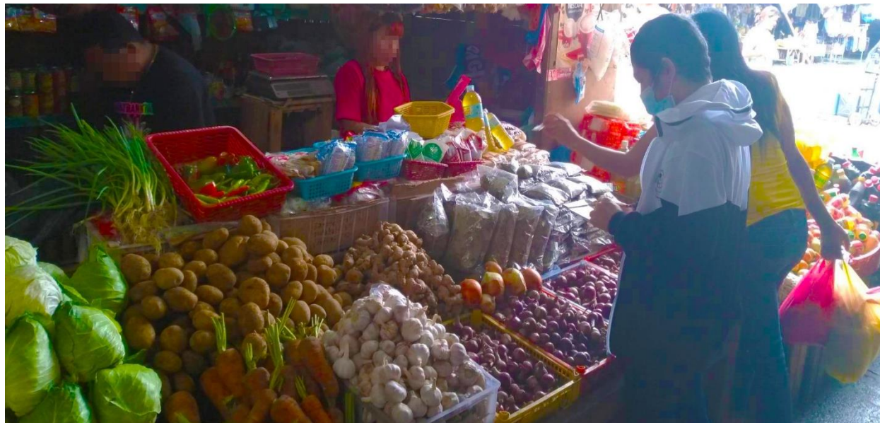
PSA Aklan staff collecting retail prices of various food commodities at Kalibo Public Market

Date of Release: May 9, 2023 Reference No. 2023-010