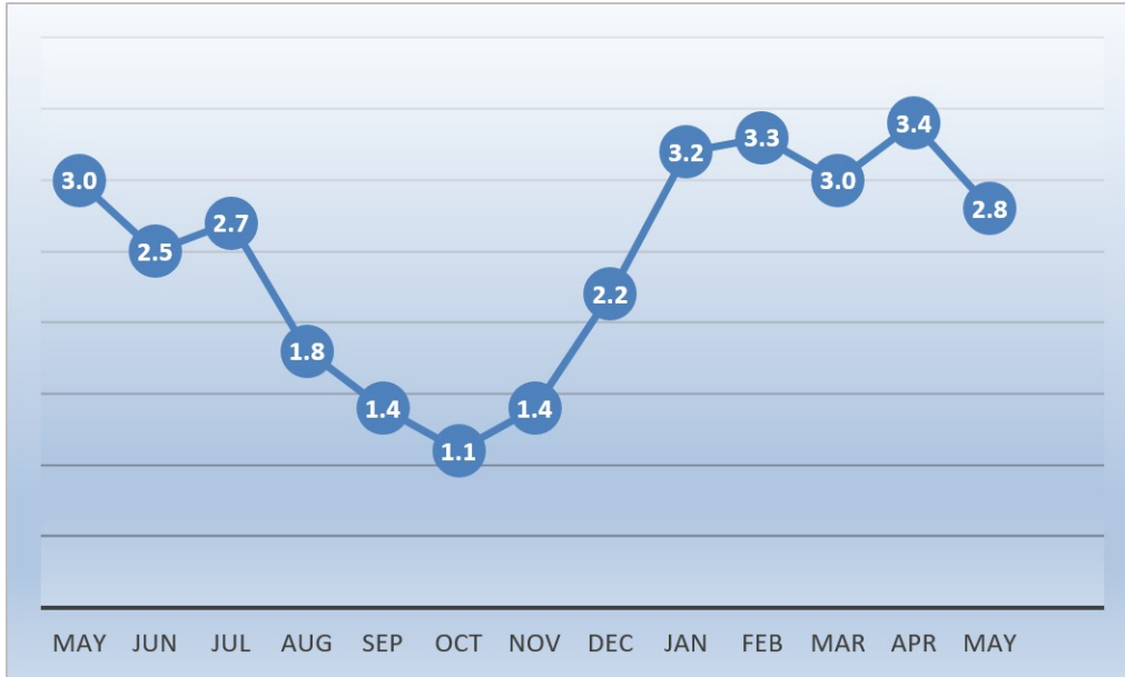
Figure 2. Monthly Inflation Rates in Western Visayas May 2019 - May 2020 (2012=100)

Western Visayas May 2020 inflation rate of 2.8 percent decelerated from the 3.4 inflation rate in the preceding month of April 2019. Year-to-date inflation also shows a slowdown from 3.0 percent in May 2019.