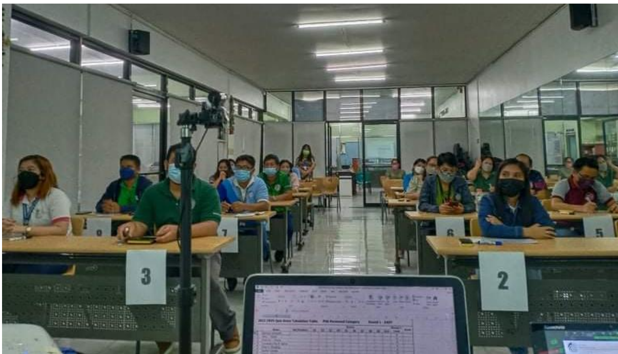
Contestant listening to the mechanics and criteria for the quiz bee contest.